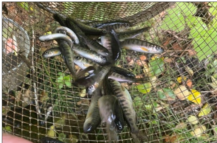
Figure 1.–Juvenile coho salmon caught at waypoint 1166.