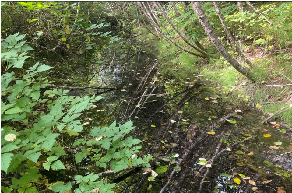
Figure 3.—Looking downstream at waypoint 1166.