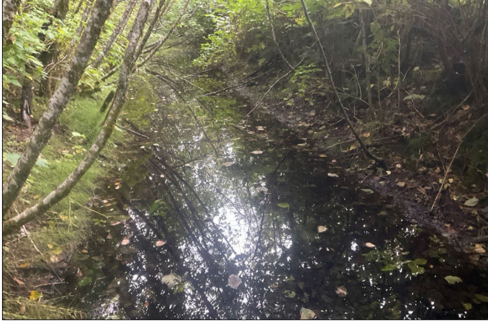
Figure 2.—Looking upstream at waypoint 1164.